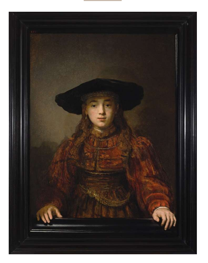
Rembrandt – Hoogstraten Colour and Illusion 8 October 2024 to 12 January 2025

In autumn 2024 the Kunsthistorisches Museum Vienna will show an unprecedented variety of major works by the Dutch Baroque painter Rembrandt Harmensz. van Rijn (1606–1669) in the exhibition Rembrandt – Hoogstraten. Colour and Illusion . For the first time, Rembrandt and his oeuvre are presented from the perspective of his talented pupil Samuel van Hoogstraten (1627–1678).