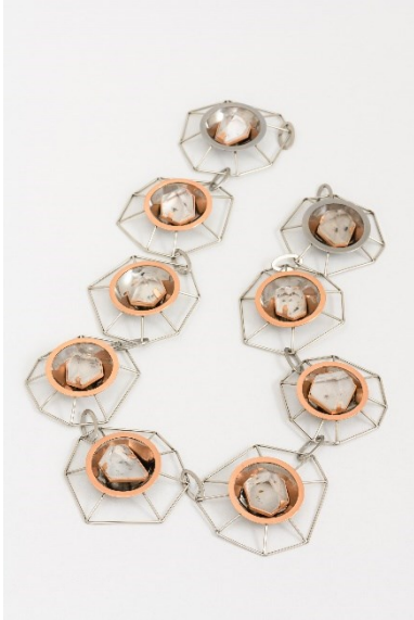
Anna Heindl Katharina 2024 Collier 14k redgold, crystals, stainless steel © Anna Heindl