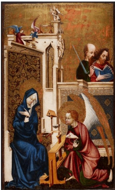
Master of Heiligenkreuz The Annunciation c. 1415/20 Painting and poliment gilding on oak wood 71.8 × 43.8 cm Vienna, Kunsthistorisches Museum Provenance: Heiligenkreuz Abbey, Lower Austria, acquired from there in 1926