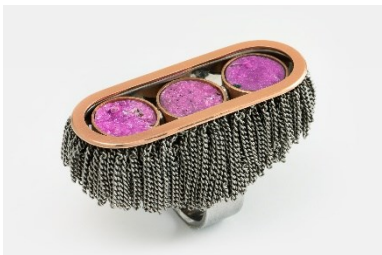
Anna Heindl Pink Treasure 2024 Ring 14k redgold, cobalt calcites, stainless steel © Anna Heindl