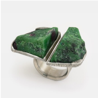
Anna Heindl Split Rocks 2024 Ring Rubin Ziosit, stainless steel © Anna Heindl, Photo: Manfred Wakolbinger