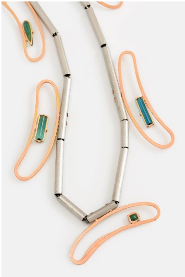
Anna Heindl Opening 2024 Collier 14k redgold, green turmalins, stainless steel © Anna Heindl, Photo: Manfred Wakolbinger