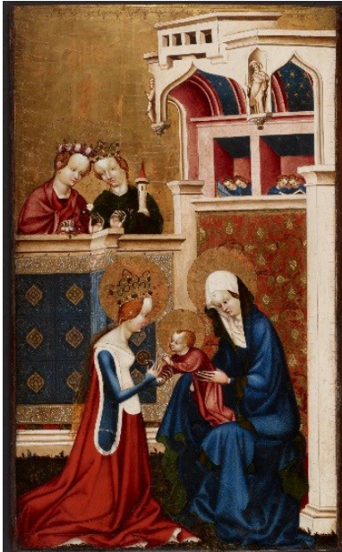
Master of Heiligenkreuz The Mystical Marriage of Saint Catherine c. 1415/20 Painting and poliment gilding on oak wood 71,8 × 43,8 cm Vienna, Kunsthistorisches Museum Provenance: Heiligenkreuz Abbey, Lower Austria, acquired from there in 1926