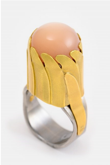
Anna Heindl Orange Moon in Leaves 2015 Ring 19k gold, orange moonstone, stainless steel © Anna Heindl, Photo: Manfred Wakolbinger