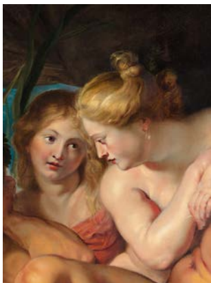
Peter Paul Rubens (1577 Siegen - 1640 Antwerp) The Four Rivers of Paradise (detail) c.1615, oil on canvas, 208 x 283 cm Vienna, Kunsthistorisches Museum, Gemäldegalerie, inv. no. GG 526