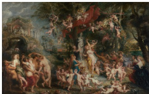
Peter Paul Rubens (1577 Siegen - 1640 Antwerp) The Feast of Venus 1636/37, oil on canvas, 217 x 350 cm Vienna, Kunsthistorisches Museum, Gemäldegalerie, inv. no. GG 684