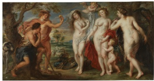
Peter Paul Rubens (1577 Siegen - 1640 Antwerp) The Judgment of Paris c.1639, oil on canvas, 199 x 381 cm Madrid, Museo Nacional del Prado, inv. no. P1669