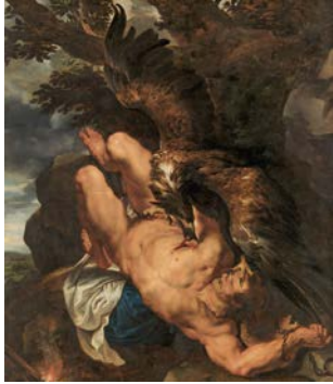
Peter Paul Rubens (1577 Siegen - 1640 Antwerp) Frans Snyders (eagle) Prometheus 1611/12–1618, oil on canvas, 242.6 x 209.6 cm Philadelphia Museum of Art, purchased with the W. P. Wilstach Fund, 1950, inv. no. W1950-3-1