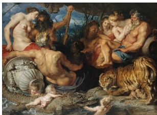
Peter Paul Rubens (1577 Siegen - 1640 Antwerp) The Four Rivers of Paradise c.1615, oil on canvas, 208 x 283 cm Vienna, Kunsthistorisches Museum, Gemäldegalerie, inv. no. GG 526