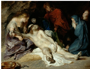
Peter Paul Rubens (1577 Siegen - 1640 Antwerp) The Lamentation 1614, oil on oak, 40.5 x 52.5 cm Vienna, Kunsthistorisches Museum, Gemäldegalerie, inv. no. GG 515