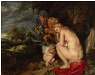
Peter Paul Rubens (1577 Siegen - 1640 Antwerp) Venus Frigida 1614, oil on oak panel, 145.1 x 185.6 cm Antwerp, Koninklijk Museum voor Schone Kunsten, inv. no. 709