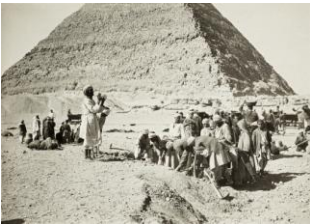
Archaeological excavations at the foot of the Pyramids 1928