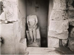
Statue of Prince Hemiunu in situ in his Tomb in Giza 1912