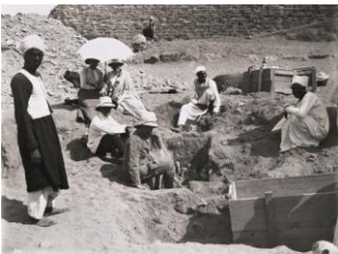
The Archaeologist Hermann Junker (seated in the foreground wearing a pith helmet) and his team uncovering statues from the mastaba of Shepsesptah 1913