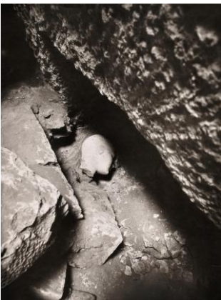
„Reserve Head“ (now in Vienna) in situ in the tomb where it was found 1914