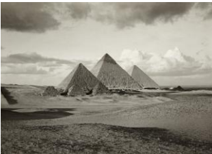
The Pyramids of Giza c. 1912