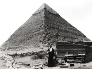
The Pyramid of Khafra